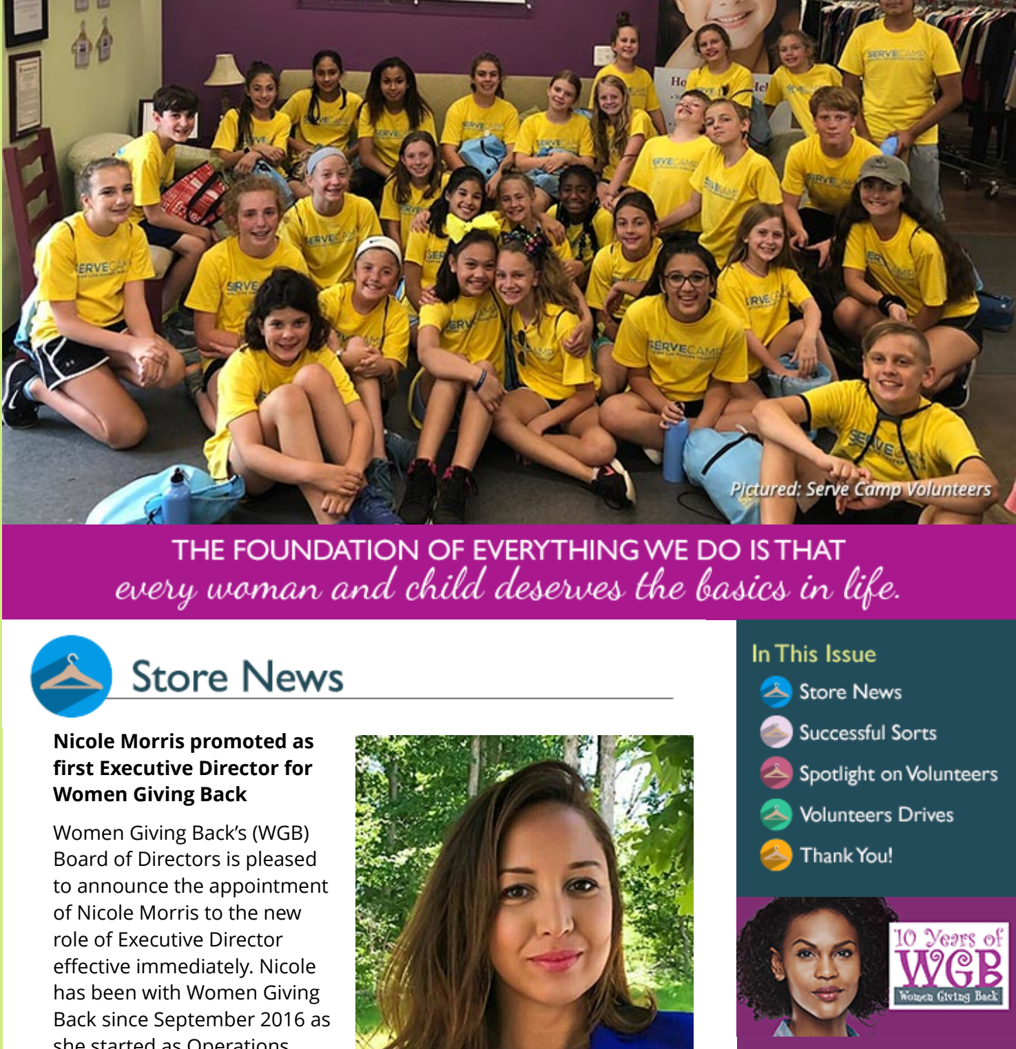
Pictured: Serve Camp Volunteers

THE FOUNDATION OF EVERYTHING WE DO IS THAT every woman and child deserves the basics in life.